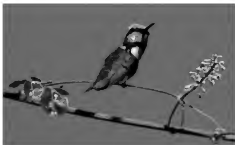
Bee hummingbird