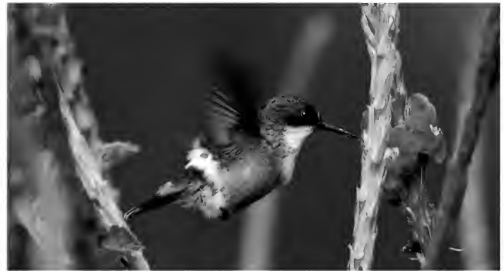
White-crested Coquette