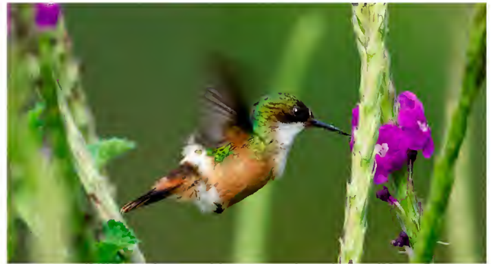
White-crested Coquette